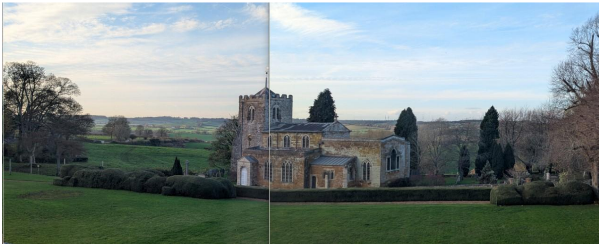
View from the Yellow Room